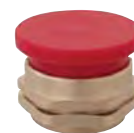
Part No. Description PC-5M-(color) 1 3/16-28 Thd., Mushroom (specify color)